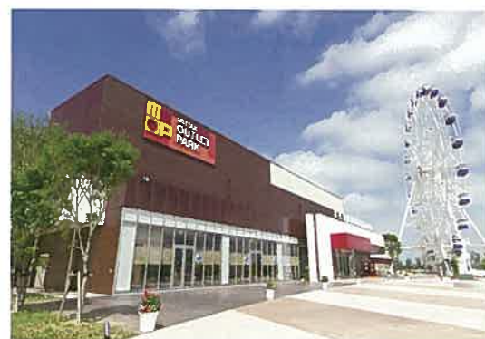
Mitsui Outlet Park Hokuriku Oyabe

An all-weather indoor outlet shopping mall. In addition to the shops and services to satisfy your wants for shopping and food, the play area and Ferris wheel lets children have just as much fun.