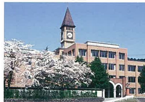
Isurugi Junior High School

A series of public buildings resembling famous architectural pieces in and outside Japan. These 35 buildings were each constructed to accommodate their surrounding natural environment, allowing visitors to take a fantastic ("meruhen") walk through town.