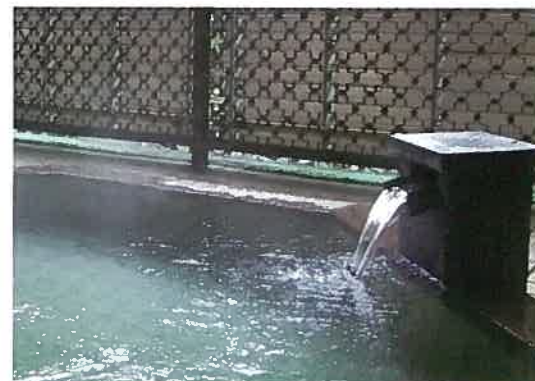
Near the Miyajima Gorge lies a little-known hot springs hotel. Bathe and relax while listening to the sound of a trickling river, enjoying your moment of relief.