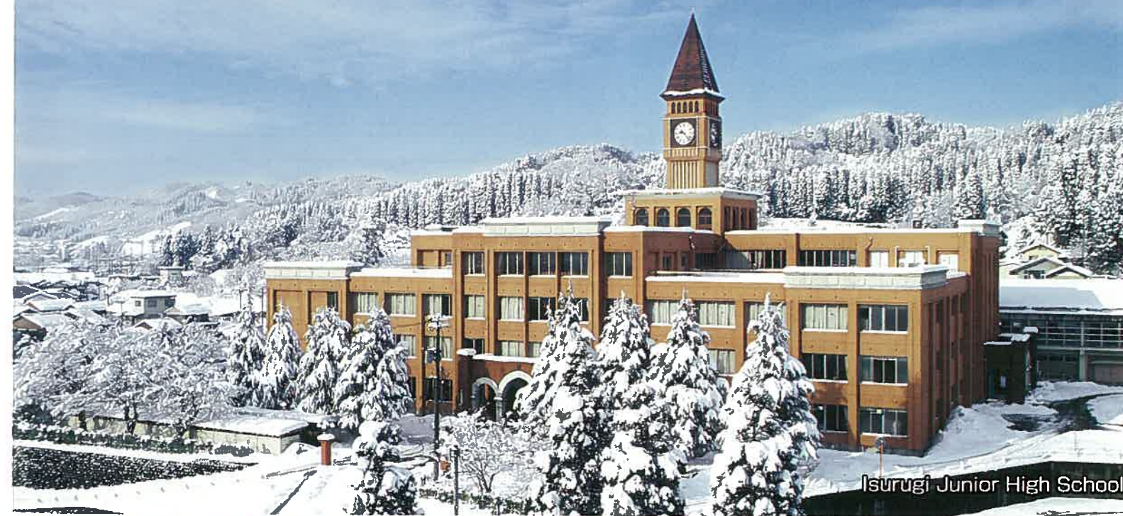
Isurugi Junior High School