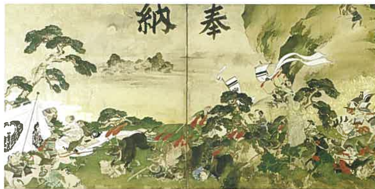
Folding screen depicting the Battle of Kurikara during the Genpei War (Stored at Kurikara Shrine, Tsubata Town, Ishikawa Pref.)

In 1183, Yoshinaka Minamoto (Kiso) engaged the 100,000-strong army led by Koremori Taira from Kyoto, at Mt. Kurikara. Yoshinaka planned the Flaming Oxen strategy, based off of an ancient Chinese example, and on the evening of May 11, began a full-scale assault with 40,000 troops. With horns blown and drums rolled, his forces unleashed the fire oxen and with a battle cry began its charge. The Taira clan army, already exhausted from the long march, was taken aback by the confusion in the evening darkness with morale lost and no orders given. Soldiers and their horses fell into the so-called "Valley of Hell," filling up this very gorge. The number of troops lost is noted in the Genpei Seisui as 18,000.