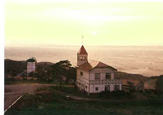
The mountain-top observation deck atop Mt. Inaba allows a full view of the Tateyama mountain range and the dispersed settlements, and its lovely night light scenery makes it perfect for a date.