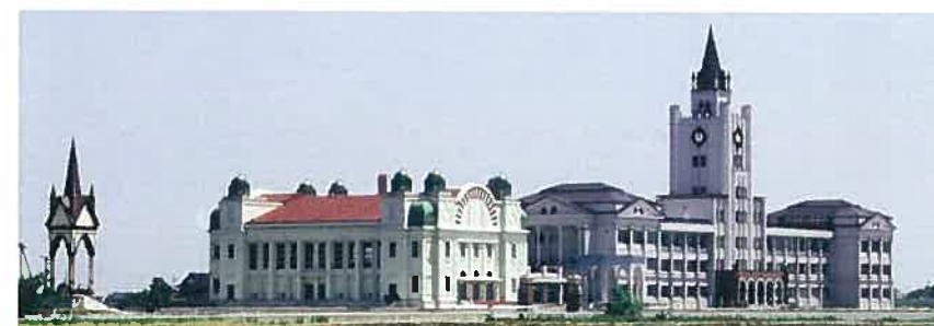
Otani Junior High School