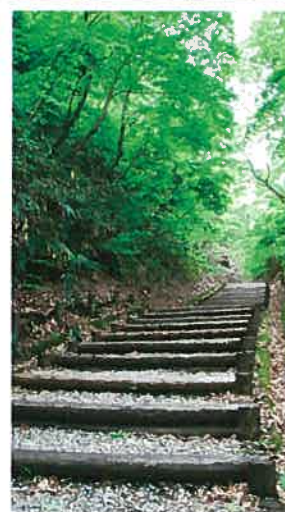
The History Road