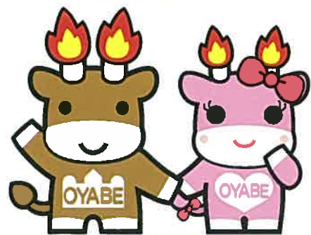
Oyabe City Mascot Merugyu Merumomo

The Oyabe City Mascots, Merugyu and Merumomo, are descendants of the "Fire Ox," known for its exploits in the Battle of Kurikara. These two characters work to promote tourism for Oyabe, and are loved by people from all over!