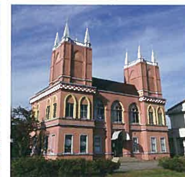
Yabunami Community Center