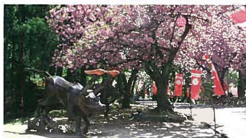
Ancient Battlefield of Kurikara (Fire Ox Statue)