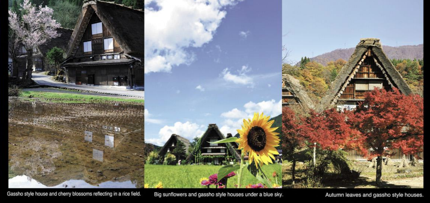
Gassho house and cherry blossoms reflecting in a rice field. Big sunflowers and gassho style houses under a blue sky. Autumn leaves and gassho style houses.