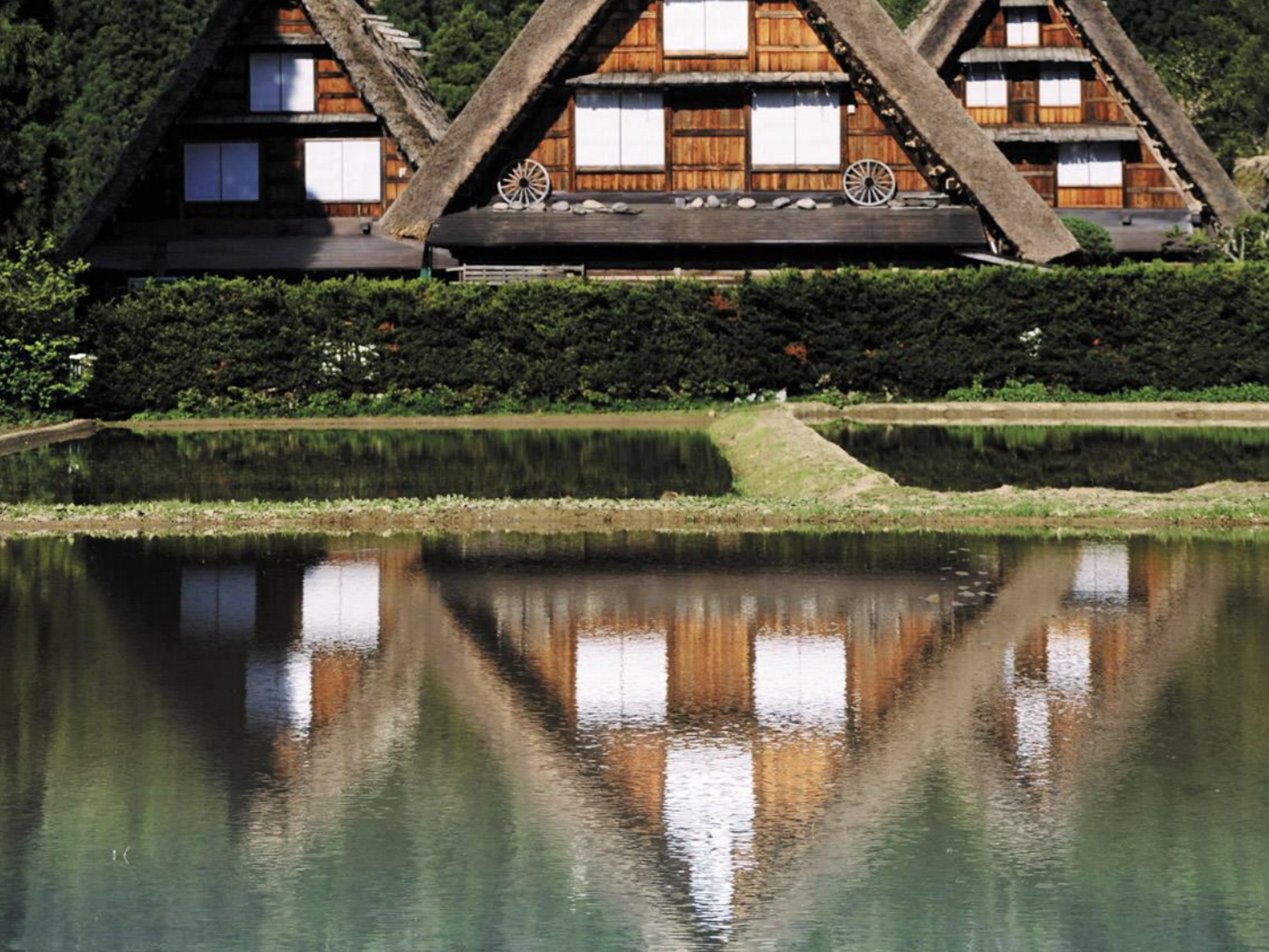
Shirakawa Village, Gifu Prefecture

A Hometown Culturally Inherited With Dignity