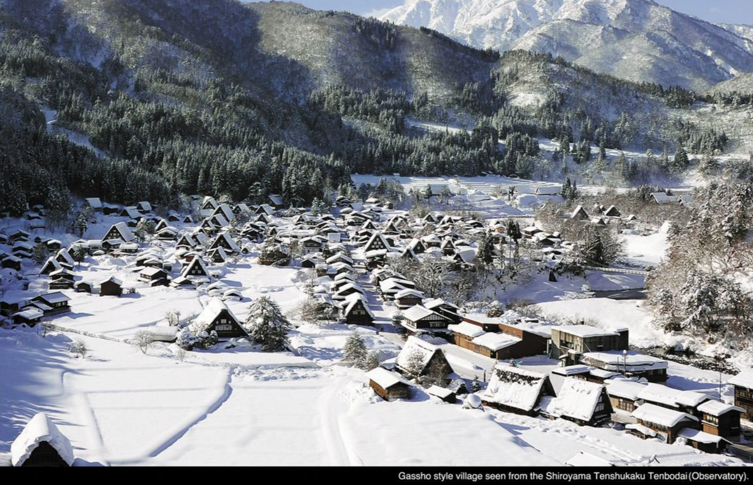
Gassho style village seen from the Shirayama Tenshukaku Tenbodai (Observatory).

"Gassho" mean "hands in prayer" It represent peaceful living nestled in this village.