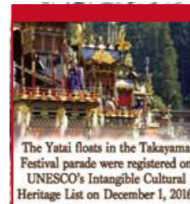
The Yatai floats in the Takayama Festival parade were registered on UNESCO's Intangible Cultural Heritage List on December 1, 2016.

www.hida.jp Hida Takayama Tourist Information Office In front of JR Takayama Station TEL 0577-32-5328 April-October : 8:30am-6:30pm November-March : 8:30am-5:00pm