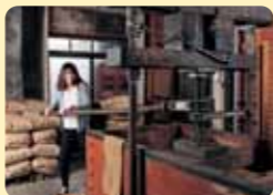
Press Soy Sauce

Nanao offers plenty to do, with lots of great hands-on experiences available. In the jonamagashi Japanese sweets hands-on experience, you can make your own sweets, then enjoy them with a bowl of matcha green tea. On the other hand, the chinkin gold inlay hands-on experience offers a way to decorate lacquered chopsticks or plates with the design of your choice, using this traditional craft. Nanao offers plenty of other hands-on experience options as well — what you do is up to you!