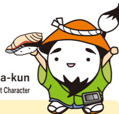
Toha-kun Hasegawa Tohaku Mascot Character

For centuries, the harbor city of Nanao has served as a hub for the Noto peninsula. With its gentle waves, Nanao Bay is a perfect fishing spot, and the area's many sushi shops offer seafood caught nearby. Nanao also still enjoys the old-fashioned atmosphere of the castle town established by Maeda Toshiie, the founder of the Kaga Domain, giving it a beautifully nostalgic atmosphere great for walking around.