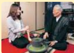
Grind Matcha Green Tea