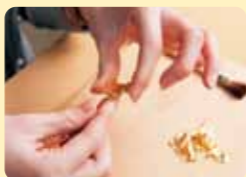
Try Foil Stamping

Hands-on Experiences Available (Reservations required. Prices and times may vary.)